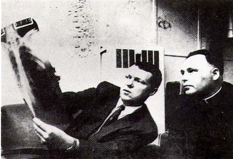
Figure 3: A Doctor onboard the MV Christmas Seal , interprets an X-ray in the summer of 1954.

X-rays being taken, often more than one X-ray per minute. 25 Those patients who were called back for a second X-ray were seen by the doctor who would read the film in the boat lounge. When active TB was found, arrangements had to be made immediately for admission to a sanatorium. 26