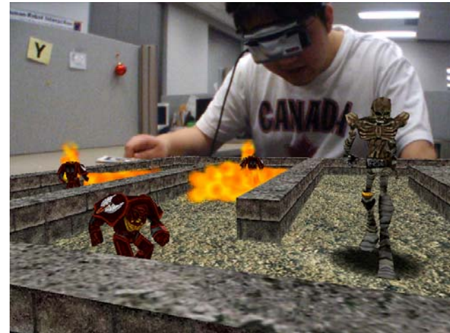
figure 1. Physical interaction in an electronic game

Many of the concepts presented for Tangible User Interfaces can be applied to physical interaction for games. First, the sense of physical immersion is enhanced in games with the use of intuitive tangible controls. In Guitar Hero , a rhythm based game is played using a realistic-looking guitar and natural guitar-playing hand gestures. This direct correlation between interaction in the physical and game worlds enables players to temporarily suspend disbelief and lose themselves in the game.