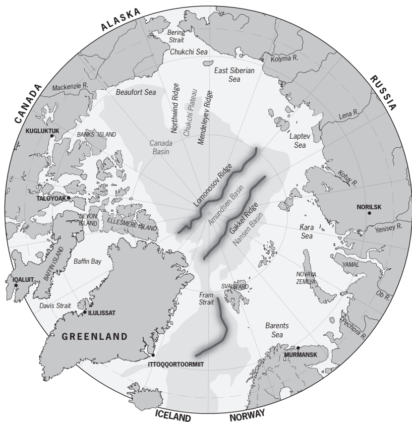
FIG. 1. POLAR VIEW. LOOK DOWN ON THE ARCTIC AND THE IMMENSE SPAN OF COASTLINE BELONGING TO RUSSIA STANDS OUT, WITH CANADA, NORWAY, GREENLAND, AND THE UNITED STATES HAVING MUCH SMALLER OCEAN FRONTAGES. OVERLAPPING CLAIMS FAR OUT IN THE ARCTIC SEAS WILL NEED NEGOTIATION TO SETTLE. (GRAPHIC: NIGEL HAWTIN.)