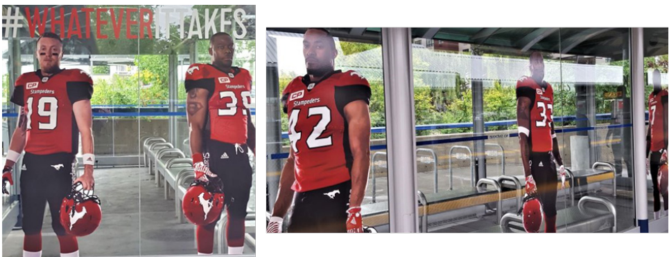
Figure 3. The players.

What requires more thought is why the remaining four players on display are Black. By no means a football fan myself, let alone a fan of the Calgary Stampeders, I was curious about the racial identity of the members of that team in 2016 and I looked online to see