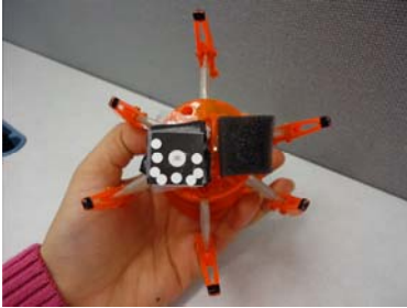
Figure 2. Byte tag attached to the robot for tracking on the MS Surface

We implemented Spidey using a simple Hexbug™ spider robot which is controlled by an IR remote. Spidey can move forward and backward and rotate left and right. The robot is tracked using byte tags of the Microsoft Surface placed on the bottom part of its body as seen in Figure 2. Tracking the robot still allows the Surface to track multi-touch which can be associated with user's fingers or with other robots. The robot is controlled via its original IR remote, and which we are controlling directly using a USB data acquisition interface unit (ONTRAK ADU100). The IR remote is placed either on the side of the Surface, or hanging above it to avoid occlusions from the user's hands. In this manner Spidey is being spatially tracked as one of the MS Surface multi-touch entities, while its commands are sent to it via the IR port.